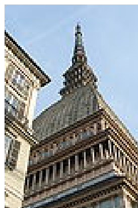
Torino process 2010